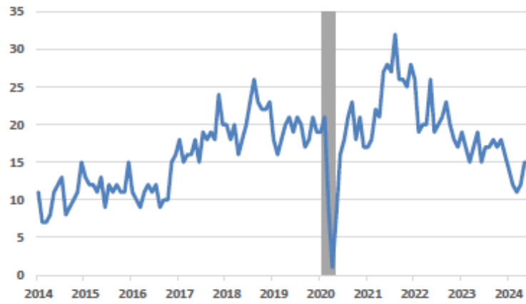
Percent of Small Firms Planning to Increase Hiring